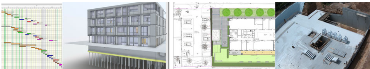
Example of different data types used on the Building Lab construction site (from left: spreadsheet, IFC Model, map, image)

The construction site is a complex system. It has different actors who provide and use different information about objects during construction phases. The process of integrating information from distributed sources is a common challenge in many construction projects. In the context of distributed data infrastructures, catalog systems make a significant contribution to solving the challenge of data integration. However, the existing frameworks for the management of construction processes (e.g., Common Data Environment) are not designed for the management of Digital Twins.